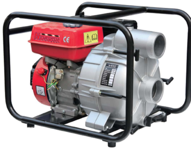
Sewerage Water Pump