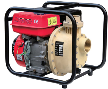
Sea Water Chemical Pump