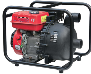
Sea Water Chemical Pump